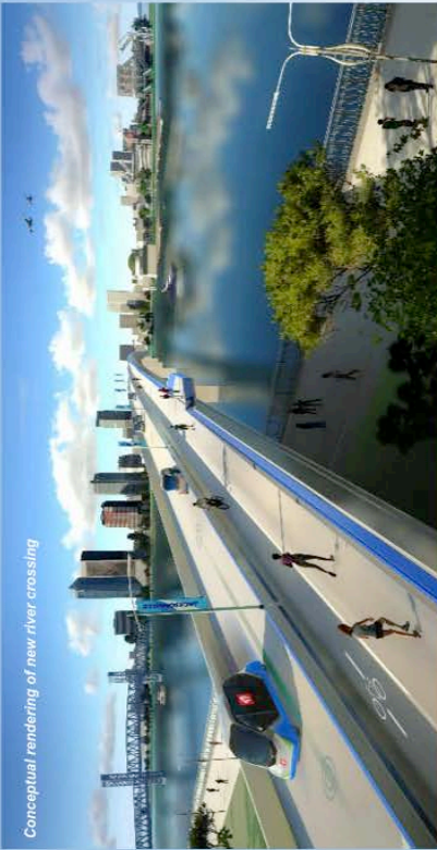
Conceptual rendering of new river crossing