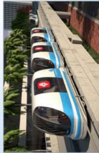
Conceptual rendering of new autonomous vehicles