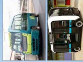
Autonomous Vehicle Examples